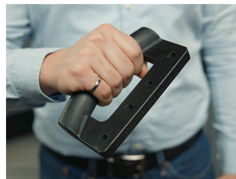
The 3D printed handle in Dura56 material.